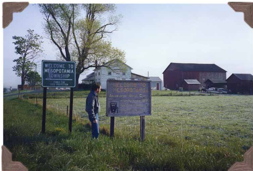
MESPO May 9, 1985