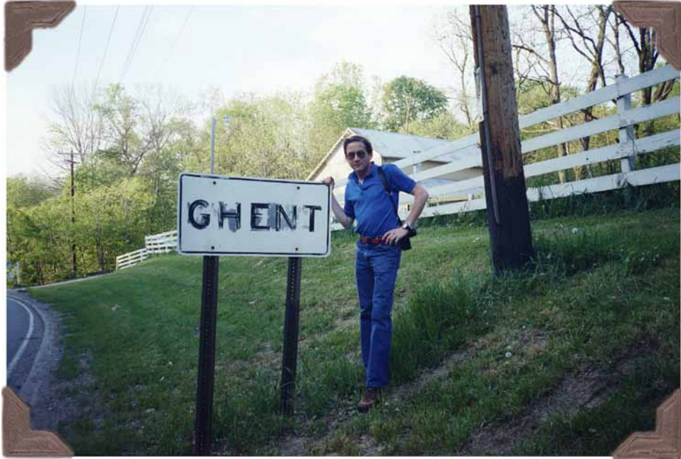
JENT May 9, 1985